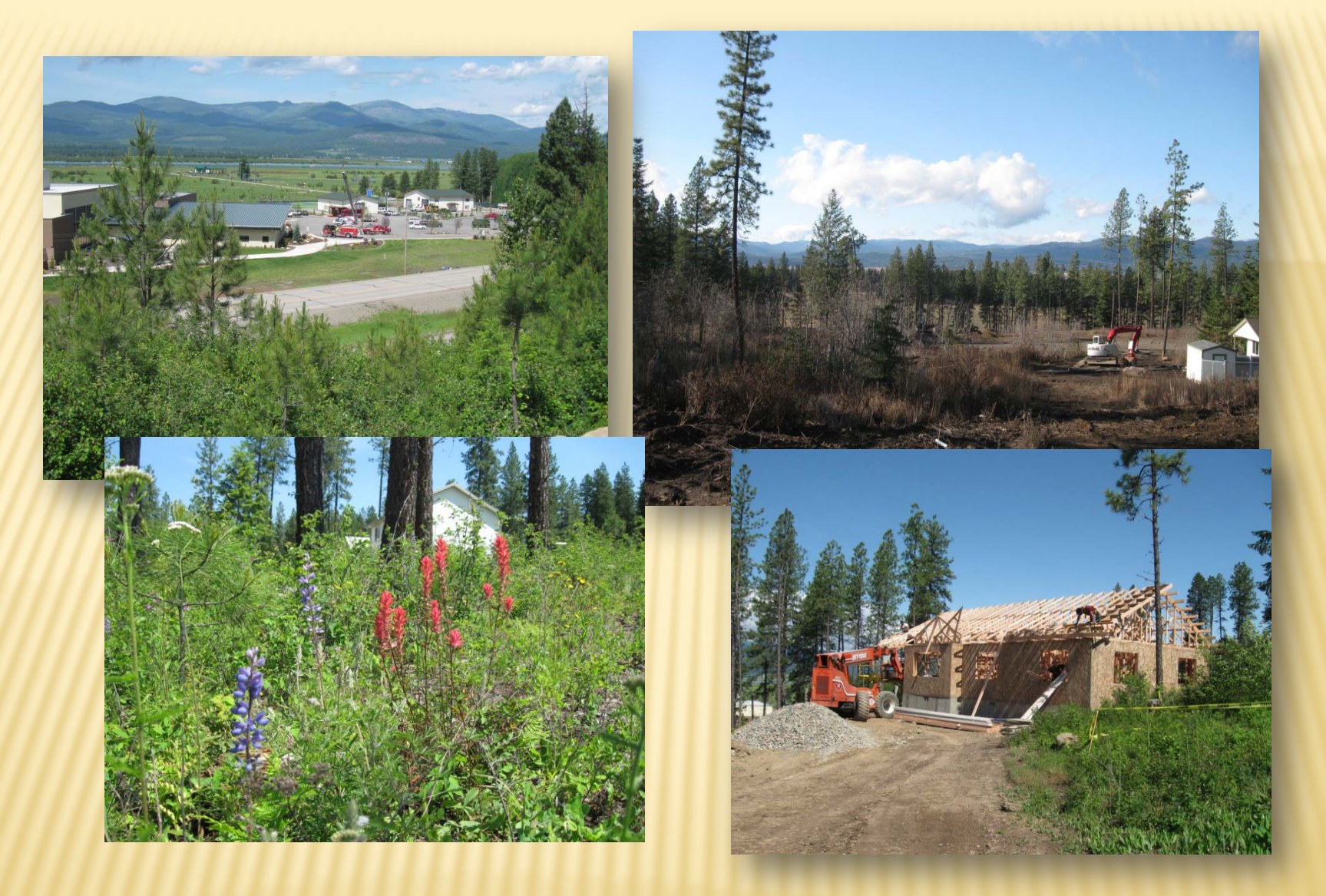
ALL OF THE HOMES HAVE VIEWS OF THE VALLEY AND MOUNTAINS